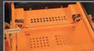
Pierced, extruded steel footplate is rubber iso-mounted for enhanced comfort.