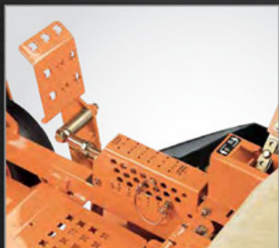
Foot pedal deck lift makes changing the height of cut fast and easy. Adjusts from 1" to 5" in ¼" increments.

Highly maneuverable and equal parts tough and productive, the Tiger Cat® makes quick work of open areas while also easily getting through tight spots. Built with a heavy-duty tubular steel frame, the Velocity Plus™ deck, and a powerful drive system, this mower delivers it all in big cat style. Featuring a low center of gravity and large 24" drive tires, the Tiger Cat provides the stability and traction you need for challenging terrain. A weight-adjustable torsion spring suspension seat, ensures a comfortable ride as you get the job done.