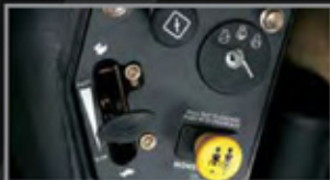
Convenient operator station puts the mower controls within easy reach.