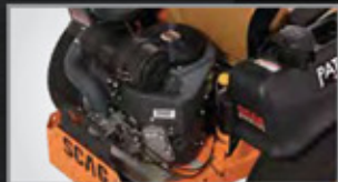
Powerful Kawasaki FXV-Twin engine options up to 23 hp provide smooth, reliable power.