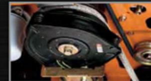
Ogura PTO clutch brake for easy deck engagement. Adjustable internal air gap for long life.