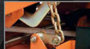
Four-corner deck leveling system ensures easy cutter deck adjustments for an even cut.