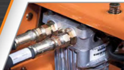
Rugged, dual 10cc hydraulic pumps feature pressure relief valves for added reliability and longer life.