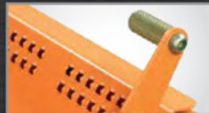
Foot pedal cutter deck lift is spring-assisted and makes raising the cutter deck smooth and easy.